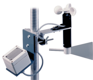
Rain Detector, Weather Station