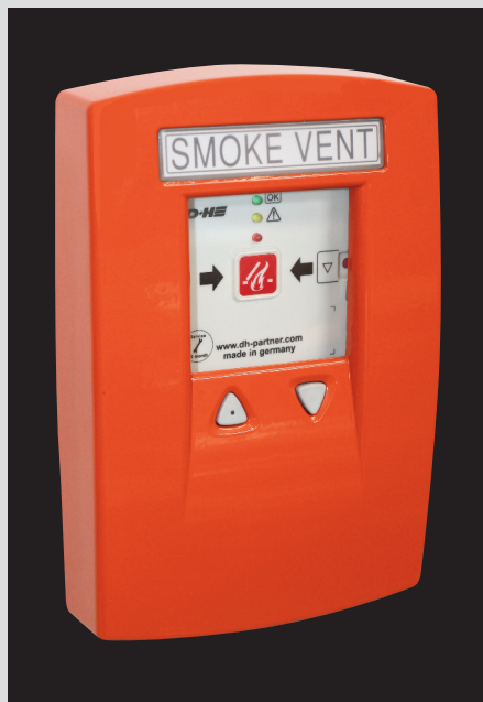
Integrated Smoke/Vent Control Panel