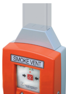
Cable and Conduit Adapter Max. 65 x 40mm