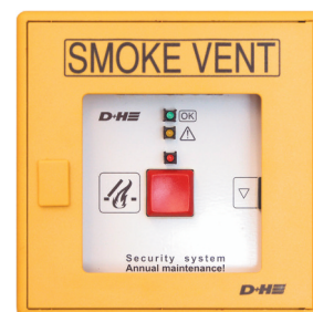
Smoke Vent Break Glass